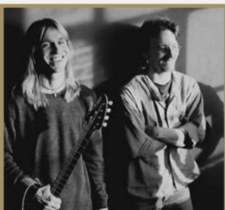
New Fusion Assembly

Walktoberfest starts at 11:00 am and continues with non-stop music until 3:30 PM. Parking and entertainment are free. For additional information about the Walktoberfest or the bands playing, go online at www.berkshumane.org .