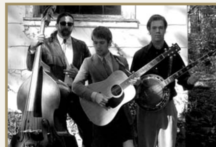
Manatawny Creek Ramblers